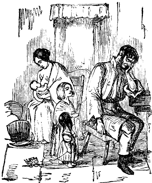
Daddy, I'm Hungry.

This is a facsimile of Mr. Thackeray's squib spoken of in the text:—